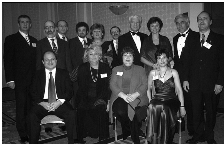
Attendees at last year's RJCF charity ball.